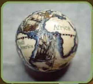
Point Seven Studios