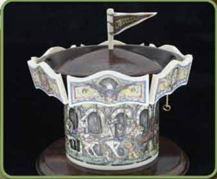
2008 Best of Show International Scrimshaw Competition – Mystic, CT