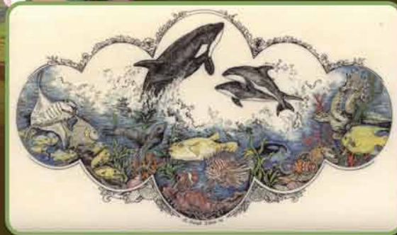
2007 Best Color Wildlife International Scrimshaw Competition – Mystic, CT