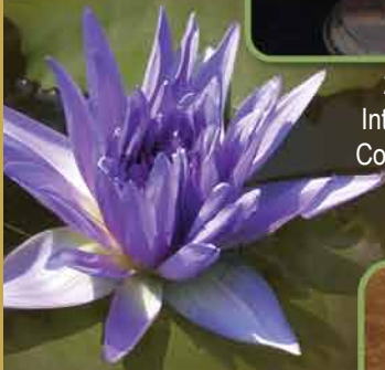
Point Seven Studios